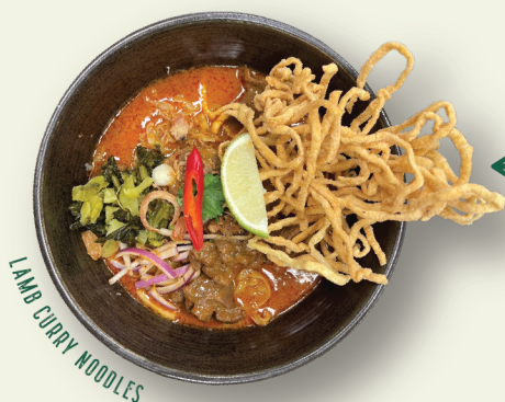
LAMB CURRY NOODLES