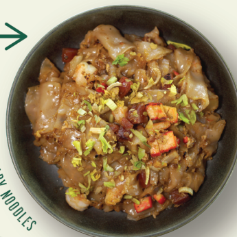
CRY BABY NOODLES