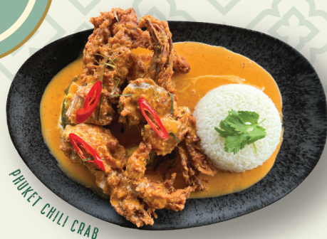
PHUKET CHILI CRAB