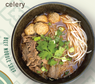
BEEF NOODLE SOUP